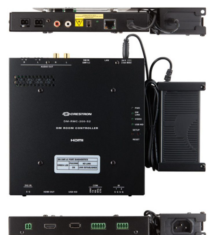
DM-RMC-200-S2 - Rear, Top, Front, and Bottom Views