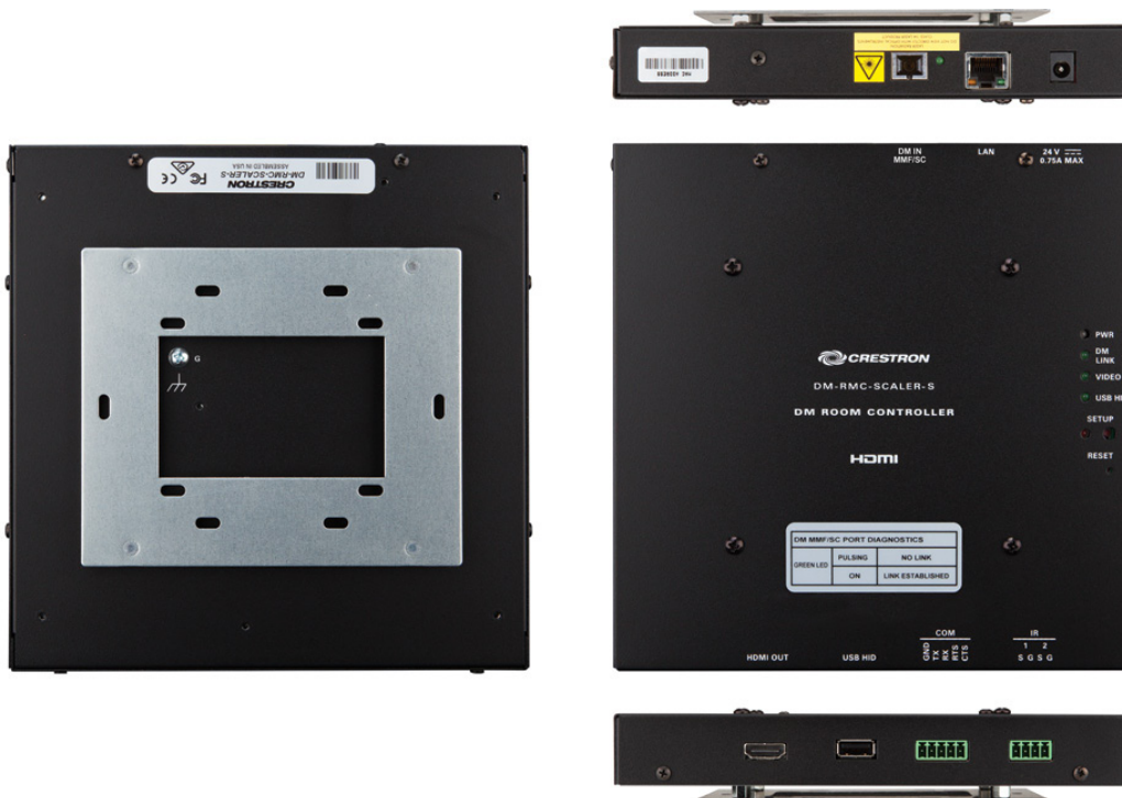
DM-RMC-SCALER-S – Rear, Top, Front, and Bottom Views

DigitalMedia 8G™ Fiber Receiver & Room Controller w/Scaler